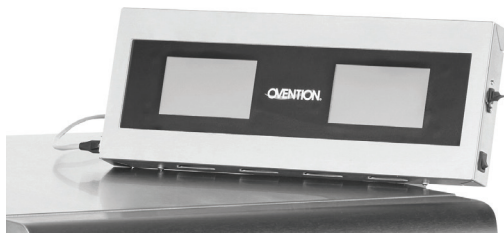
Optional remote mountable control module with 10ft cord

MORE AIR= BETTER QUALITY, FASTER Patented air flow technology means 3x more air than traditional impingement.